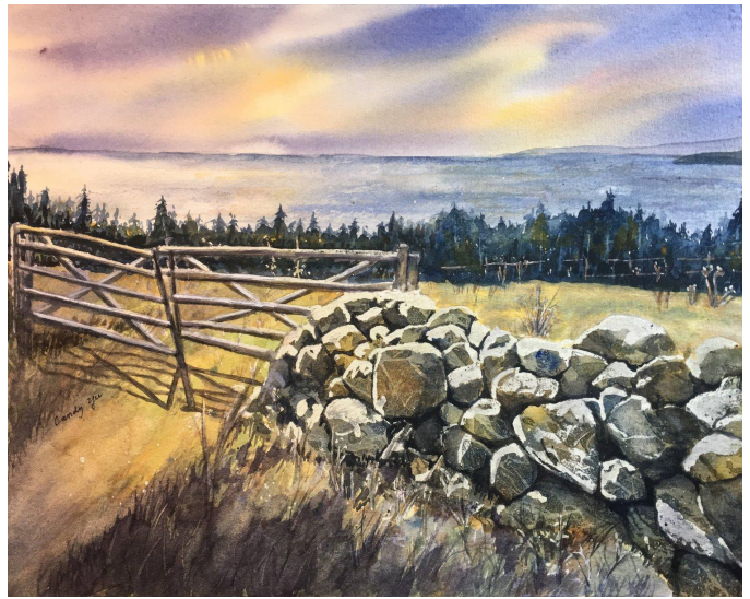
3erd: To Beach Candy Yu,