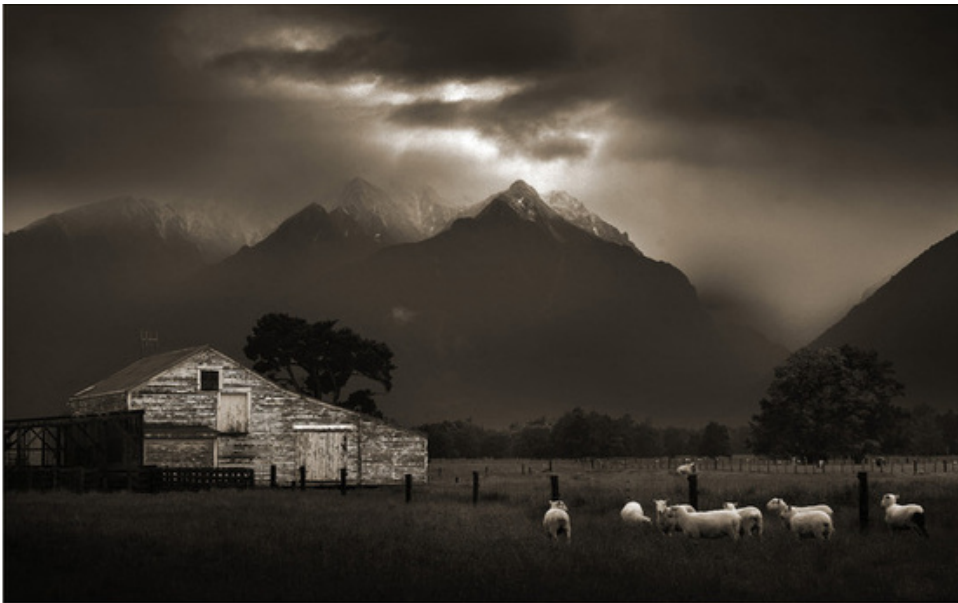
Sriharsha Annadore - Calmness of Mother Earth Photography, 12 x 18