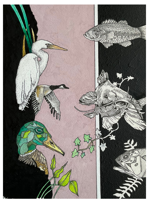
Wendell Fiock - Clear Lake Species Acrylic and Ink, 14 x 18

Sriharsha Annadore - Meadow Lark's View of the World Photography, 16 x 20