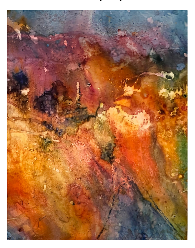
Julia Cline - Tapestry City Mixed Media, 10.25 x 13.5