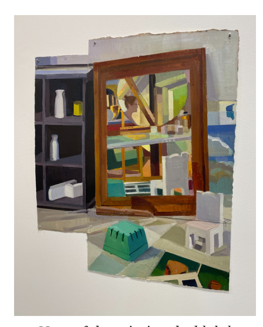
None of the paintings had labels, so unfortunately I can't credit the artists!