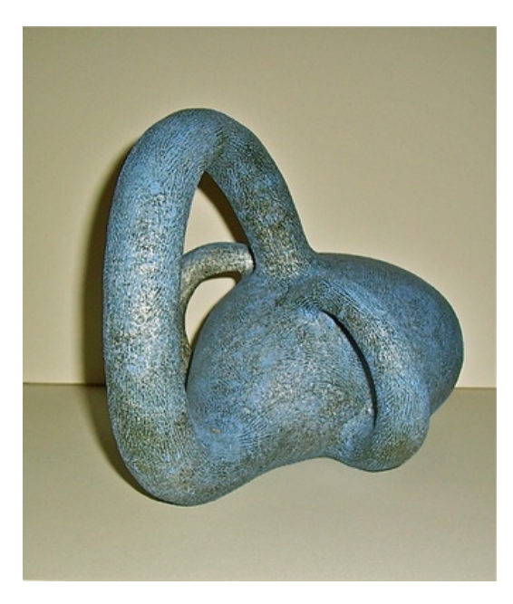
"Elephanty" by Jim Paradis

The late Jim Paradis, longtime member of EVA, was a master of the unexpected. He wound an elephant's trunk back into its head to create "Elephanty." In "Non-Objective, he dropped what resembles a colorful bowling-ball among black marks that mostly resemble chopsticks. A 3-dimensional hand grabs the edge of Jim's 2-dimensional composition "Caught Red-Handed."