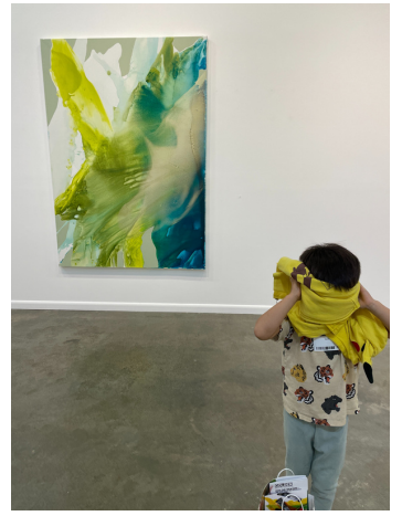
Tay mirroring the art