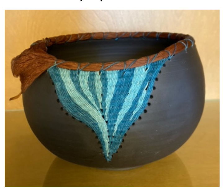
Jennifer Wool and Sloane Perroots - Clay, Fiber and Linen 6" tall x 7" wide