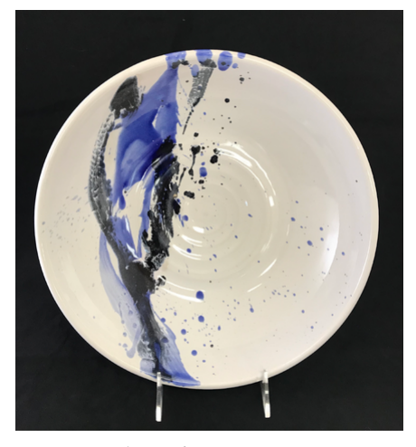
Pottery by Sloane Perroots

We quickly recognize contrasts in value, like the dark shadows on the snow in Kay's painting, or the blue and black design laid against a light ceramic background by Sloane. So also are contrasts in color: Kay's use of warm colors has made her cool colors look even cooler. Other types of contrast often go unrecognized, even though they may be doing some heavy lifting design-wise.