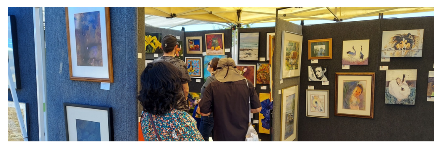
2023 Berryessa Art Festival