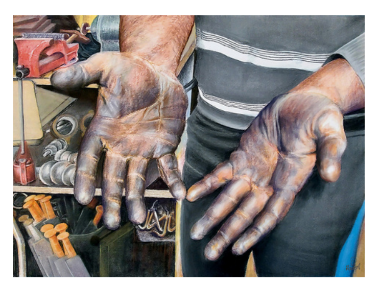
Hadi Aghaee - Working Hands Pastel Pencil - 11x14