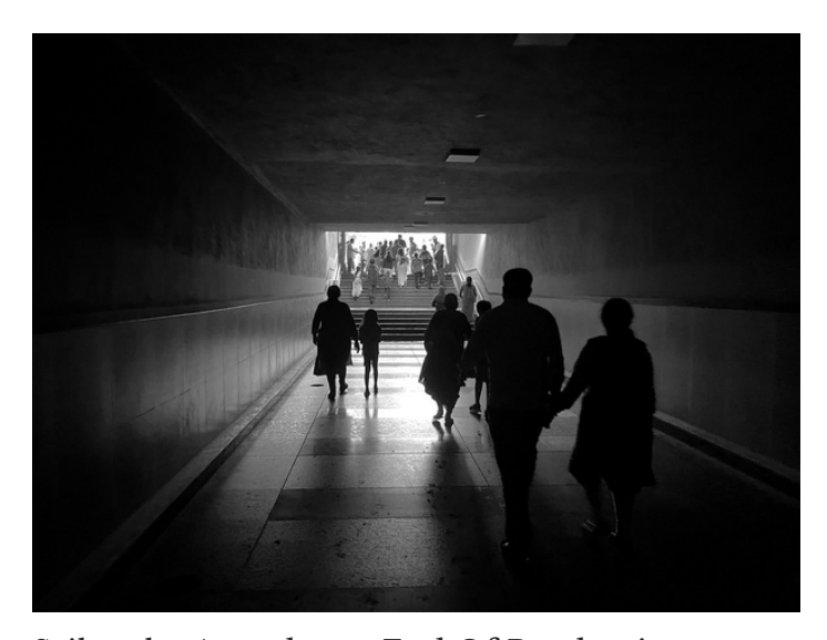
Sriharsha Annadore - End Of Pandamic Photography - 12x18