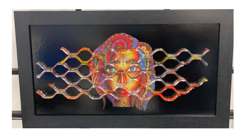
Glenna Rand - Looking Right Through You