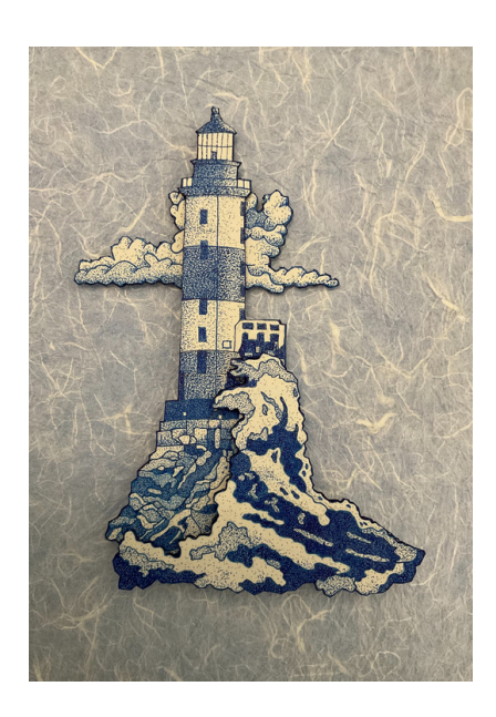
Wendell Fiock -Lone Sentry