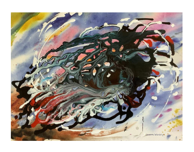
Jeanne Wardrip - Swirl