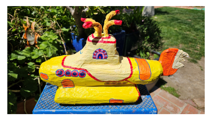
Carole Cameron - Yellow Submarine