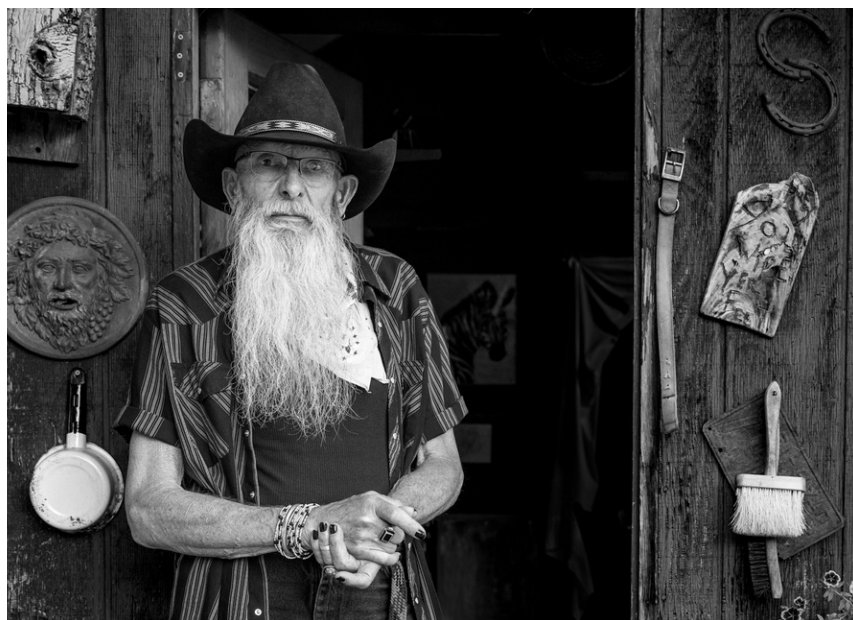
Susan Harding - Tom digital image, 20 x 16