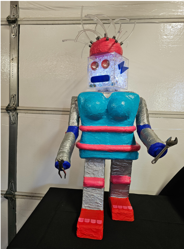
Carole Cameron - Elsa paper mache and acrylic, 36 high