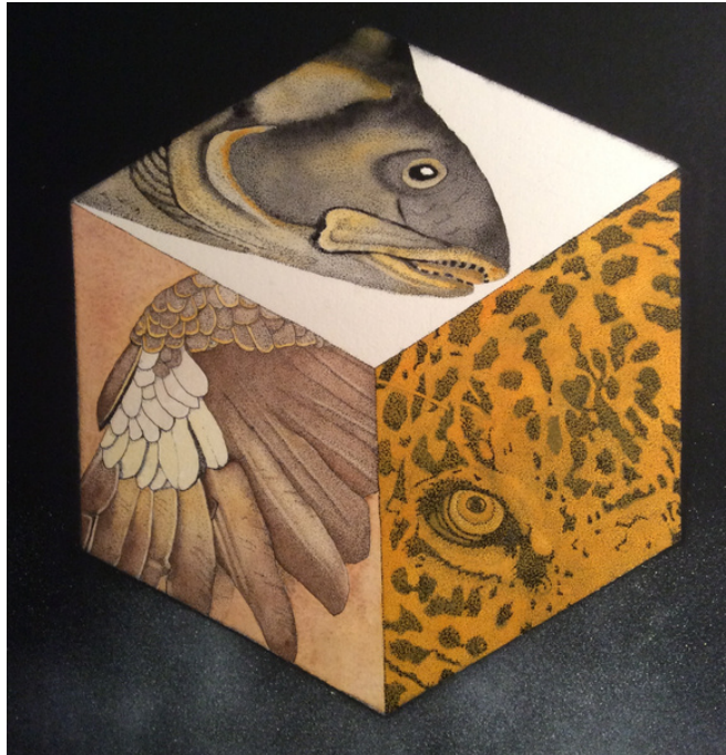
Wendell Fiock - Nature Cube ink and watercolor, 11 x 14