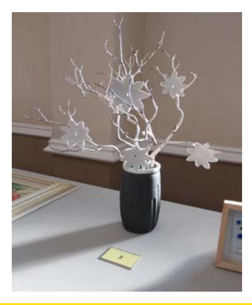
Third: Sloane Perroots, "Flowers of a Sort," clay