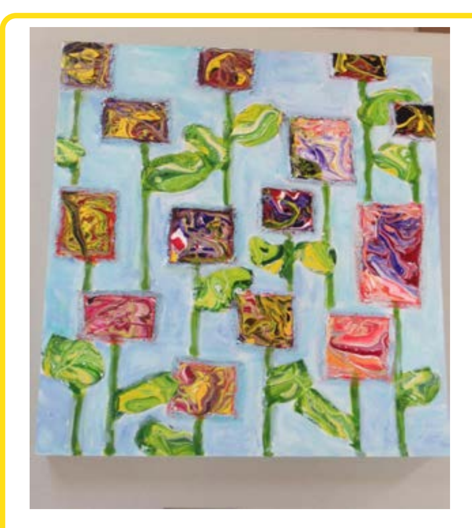
Second : Carole Cameron, "Squares," acrylic