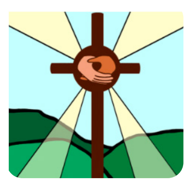
Foothill Presbyterian Church 5301 Mckee Road San Jose, CA 95127